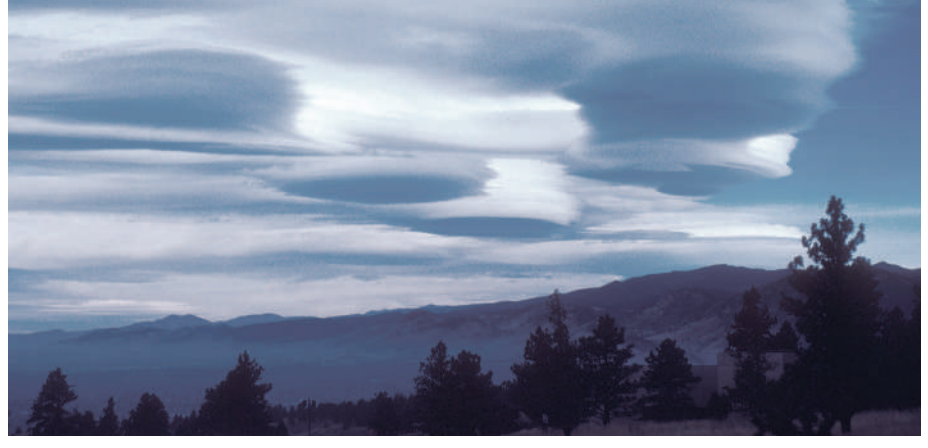
Figure 2 | Ice nucleation in wave clouds . Wave clouds — shown here — form when air is lifted up over a mountain, and water vapour in the upper reaches of the air current condenses to form water droplets. As the air current descends, the condensed water evaporates. Such an air current can bounce up and down, and with condensation at the crests of such undulations a wave-like cloud pattern can emerge. Durant and Shaw<sup>2</sup> argue that 'contact nucleation inside-out' may explain the extent of ice formation occurring in the downwind region of such currents.

becomes the thermodynamically preferred state. But the transformation first requires a germ of the crystal, a crystallite, to form. Such crystallites are created spontaneously as a result of the incessant jiggling around of molecules in the liquid, caused by thermal fluctuations. However, most of the crystallites dissolve back into the liquid. To grow, crystallites must overcome the barrier posed by surface tension the unfavourable interactions between molecules in the crystalline arrangement and those in the surrounding liquid. A large enough crystallite that can overcome the barrier is termed the critical nucleus; the process by which it forms is called nucleation. Once formed, the critical nucleus will grow irreversibly and ice will form.