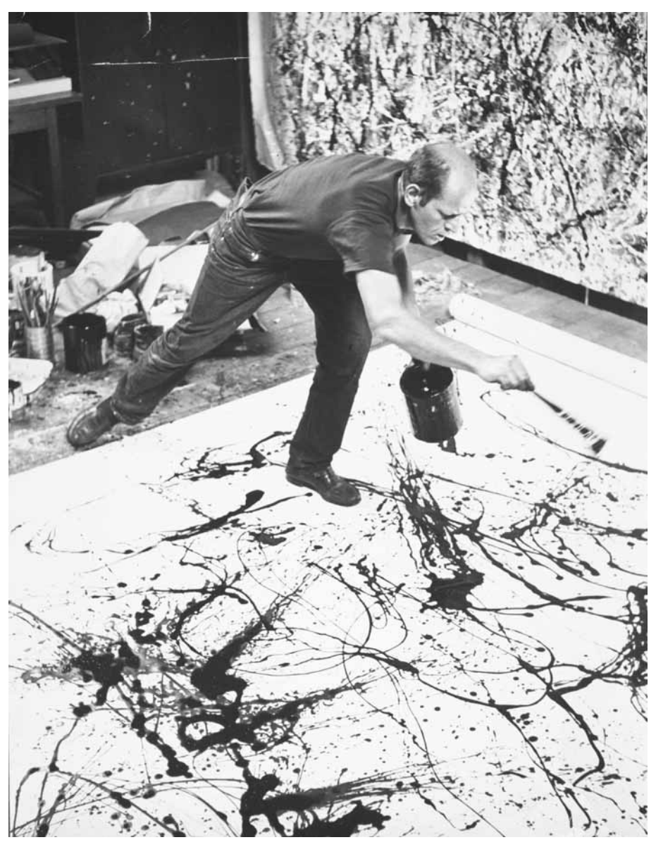
Figure 1 Jackson Pollock, 1950.

Pollock, Surrealist automatism met the field theories of 20th-century physics. 'In classical (Newtonian) physics, an electromagnetic field was defined as an arrangement of discrete, electrically charged particles,' writes Belgrad. 'But modern (Einsteinian) physics inverted this concept, defining "particles" themselves as stable patterns of electromagnetic waves' (p. 120). Thanks to Einstein, objects could no longer be thought of as immobile artifacts to be depicted; rather, they had become 'events constituted by a field of energy in