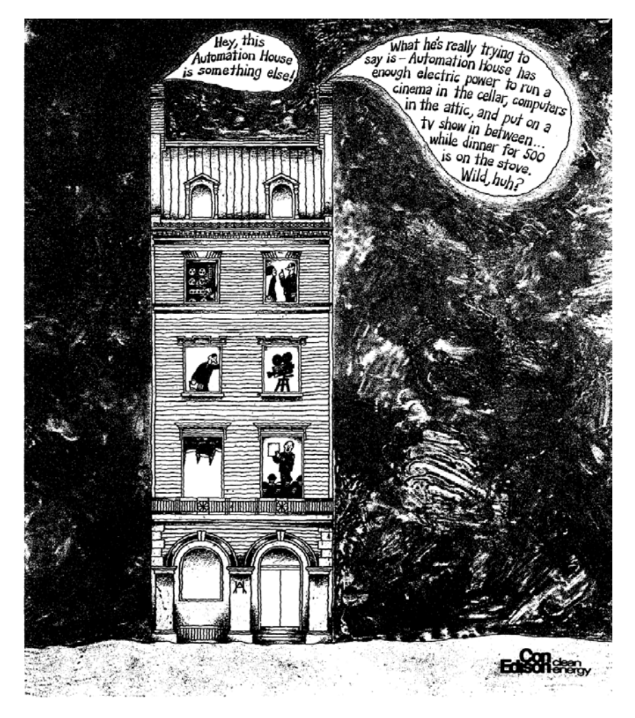
Figure 3 A Con Edison advertisement depicting Automation House, published in The New York Times, 1 February 1970.

500 is on the stove,' exclaimed a copywriter for a 1970 advertising supplement in The New York Times. 'Wild, huh?' (Con Edison, 1970). Far from replacing the human being, the communication and control technologies of Automation House promised to enrich everyday life. Moreover, they did so in terms set by the transformation of agency in relation to technology and system wrought by Cage, Rauschenberg and Pollock before them. In the Romantic automatist tradition, it had paradoxically become possible to assert creative agency by deploying automated technologies for the purpose of revealing the probabilistic, indeterminate nature of everyday life. As they wandered the floors of Automation House, moving from collective bargaining session to multimedia art exhibition, the leaders of American industry and labor could imagine themselves not as the unthinking