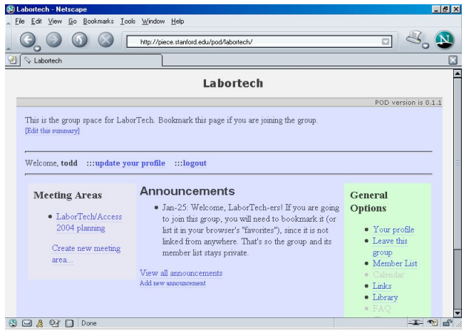
Figure 2. A group homepage