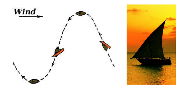
Figure 1: A triangular sail atop a traditional Arab sailing vessel, the dhow (right). Older square sails permitted sailing only before the wind. But the efficient lateen sail worked like a wing (with high pressure on one side and low pressure on the other), allowing a ship to go almost directly into a headwind. By tacking , in a zig-zag pattern, it became possible to sail in any direction, provided there was some wind at all (left). For centuries seafarers expertly combined both sails to traverse extensive distances, greatly increasing the reach of medieval navigation.<sup>1</sup>

likelihoods of observed data across assignments to hidden variables, whereas hard EM focuses on most likely completions.<sup>2</sup> These objectives are plausible, yet both can be provably "wrong" (Spitkovsky et al., 2010a, §7.3). Thus, it is permissible for lateen EM to maneuver between their gradients, for example by tacking around local attractors, in a zig-zag fashion.