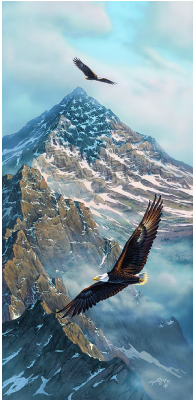
Fig. 3. Minnesota artist Rick Kelley entitled this painting “On Freedom’s Wing”. It is part of a series featuring the Bald Eagle that has raised over $40,000 for the Red Cross relief efforts following September 11th. Acrylic on masonite board coated with gesso. © Rick Kelley / Science Art.

But wait: Why connect science and art when they seem so different? Indeed, more than just different, they are often seen as polar opposites. Science typically proceeds under a system that makes it possible to re-run experiments, and scientists place a premium on the universal legitimacy of their findings. Art, meanwhile, ordinarily proceeds through the skillful use of creative imagination, and artists place a premium on the unique appeal of their style. That is, science and art are about