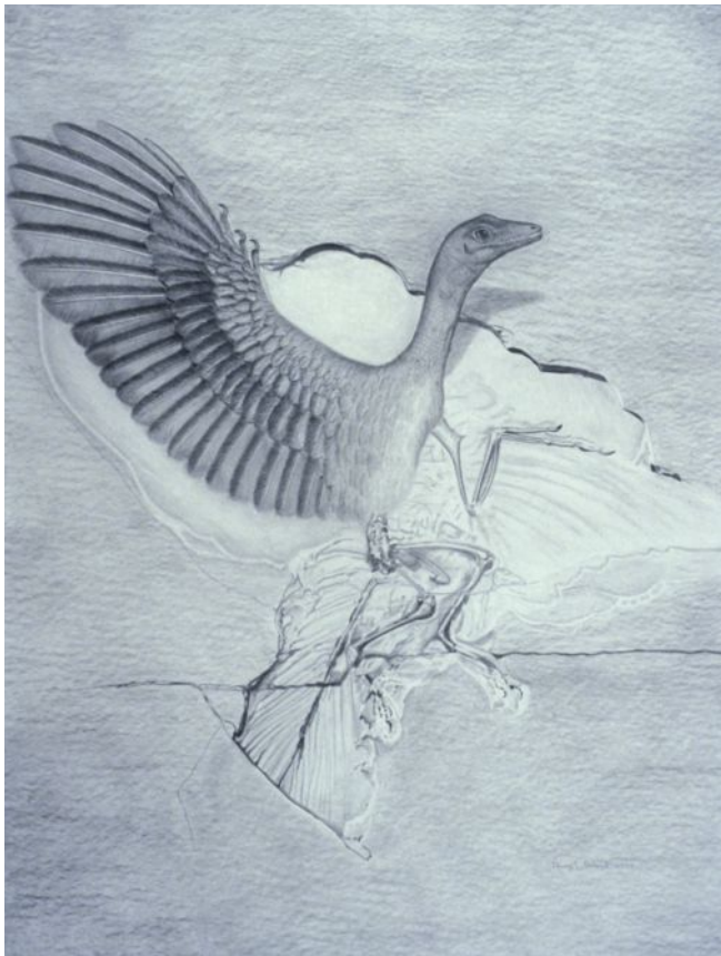
Fig. 2. Here the artist unfolds and fleshes out the well-articulated Berlin specimen of Archaeopteryx . Discovered 18 years after Darwin published On the Origin of Species (1859), it is considered by some to be the most important fossil ever found. Pencil on Bristol board. © Darryl Wheye / Science Art.

One might expect that there would be a sizable audience for this kind of artwork and ample opportunities to view it in a variety of media. And yet venues for the display of science art may be surprisingly difficult to locate. This is not due to any shortage of images, for art that translates science appears to be flourishing, even if it has yet to acquire a conventional name. Perhaps the tag “science art” will catch on, and help us gain access to images, both on canvas (by identifying a work’s genre) and online (by refining searches).