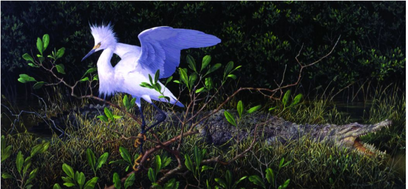
Fig. 5. The Wisconsin artist Viktor Bakhtin portrays the last moment of calm before the predator's storm, highlighting the adaptive advantage of the wing as it provides a "leg up". Watercolor on masonite. © Viktor Bakhtin / Science Art.

man aspect of science, an aspect usually suppressed in the effort to keep experimentation and analysis "transparent".