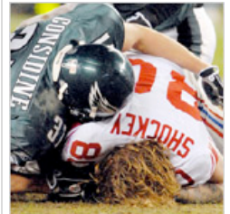
Araton: Sense or Sentimentality