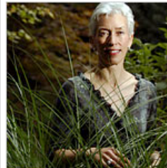
Human Skin Is an Anthropologist's Map