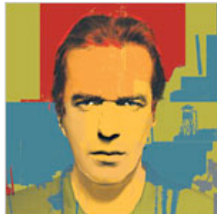
Review: Martin Amis's 'House of Meetings'