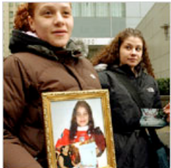
Girl Is Dead a Year, and Many Can't Forget