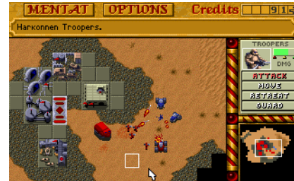
Figure 3: Similarities of Dune II (above) and C&C (below)

Top 100 game chart within two weeks of release (Chown). An examination of what C&C brought to RTS may provide insights.