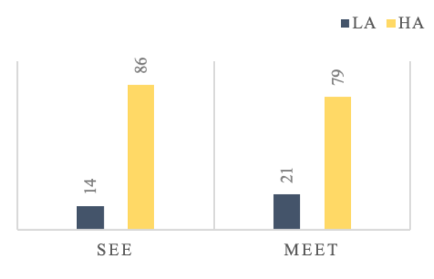
Figure 1. The results of experiment 1

In experiment 1, high attachment (NP2) was significantly preferred over low attachment (NP1), as shown in Figure 1. Although the percentage of high-attachment answers was slightly higher in the state verb condition (86%) than the action verb condition (79%), the difference was not statistically significant (logistic regression model: p > 0.11). Regardless of the main verb type, strong high-attachment preference was observed.