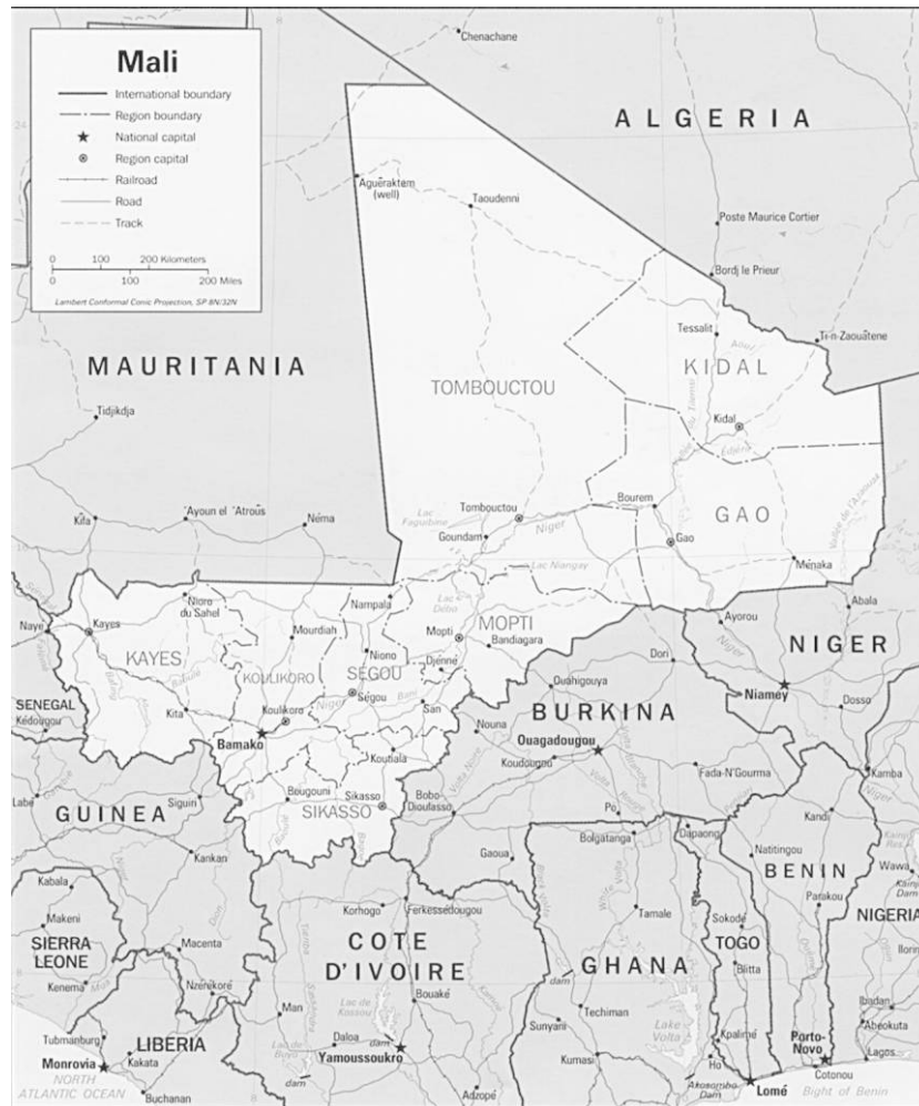
FIGURE 4. Map of Mali.

in the village of Neba, which is twenty-five miles northeast of Sikasso in southeastern Mali. Sikasso is Mali's second largest city (fig. 4). The Kenedougou region (as the area around Sikasso is known) is one of Mali's richest agricultural areas (known for cotton, rice, millet, corn, vegetables, and fruit) and has the country's highest annual rainfall (fifty-five inches per year). The landscape is savannah—rolling hills with shrubs and widely spaced trees. Agricultural labor is done by hand and is backbreaking. As a child, Neba Solo herded cattle and learned to be a farmer as well as a musician. He was not sent to school but became literate as an adult through taking a course