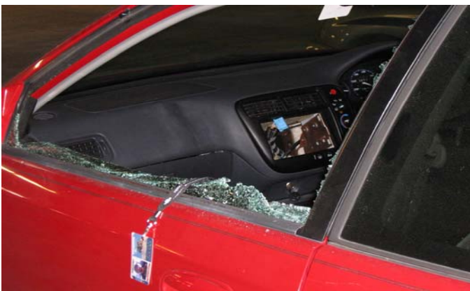
A shattering discovery

Please immediately report any suspicious persons in or about the area of parked vehicles by dialing "9-1-1" from a cell phone or by dialing "9-9-1-1" from a campus phone line.