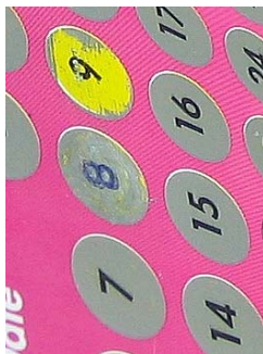
An altered permit captured on film.