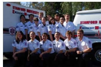
Stanford Emergency Medical Services Volunteers!

care for many events on the Stanford campus, including football games, parties, and special events such as Stanford PowWow. Crews work closely with other area EMS providers, such as the Palo Alto Fire Department, to provide high quality care to patients. StEMS is also an integral part of any medical response to a campus-wide disaster. For more information, please visit http://stems.stanford.edu .