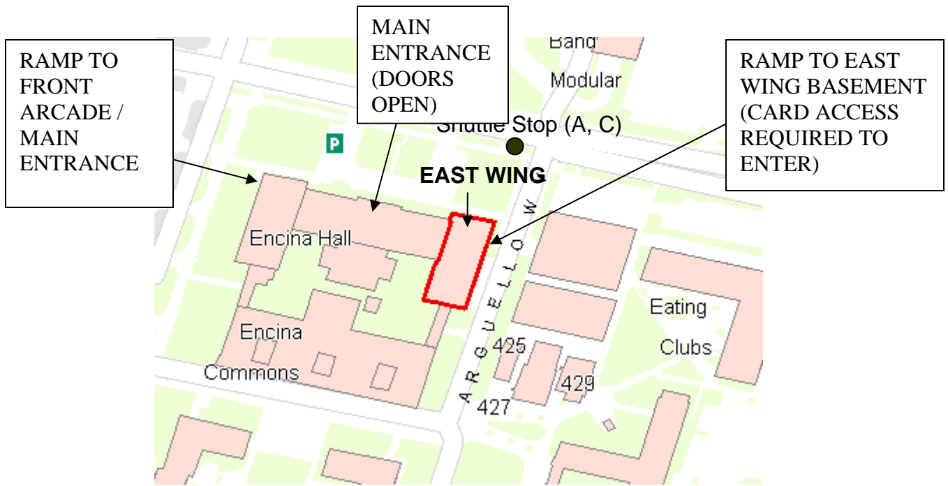
Encina Hall East Wing, 616 Serra Street, Stanford, CA