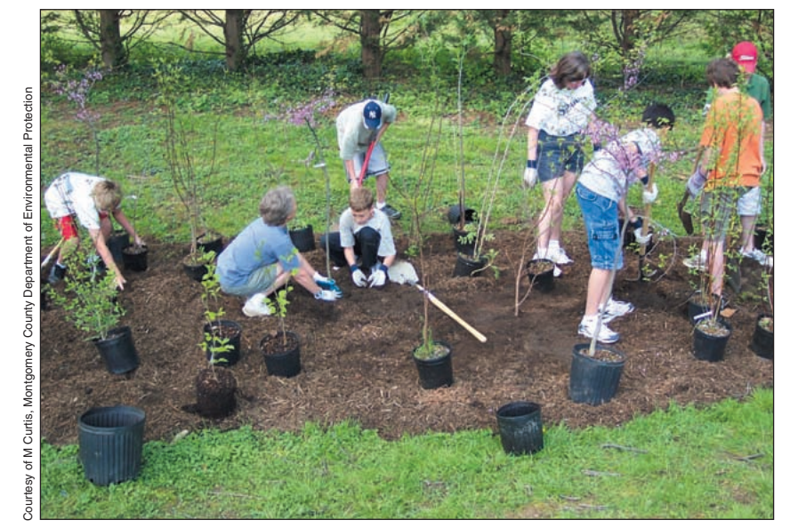
Figure 2. Students and community leaders help plant seedlings to vegetate a rain garden in Kensington, Maryland. Rain gardens such as these are designed to increase infiltration of rainwater into the soil and minimize run-off of nutrient or pollutant-rich water into stormwater systems that feed streams and rivers.

these practices can help sustain ecosystem services, for example through appropriate waste-disposal practices or the use of less environmentally persistent chemicals (Loucks et al. 1999). A recent report by the Council for Environmentally Responsible Economies (CERES), a coalition of environmental, investor, and advocacy groups, examined how 20 of the world's biggest emitters of greenhouse gases are factoring climate change risks and opportunities into their business practices (Cogan 2003). The report features a checklist of specific actions that companies can take to address climate change. Ecologists can play an active role in such projects through direct involvement or through research motivated by the needs of such ventures.