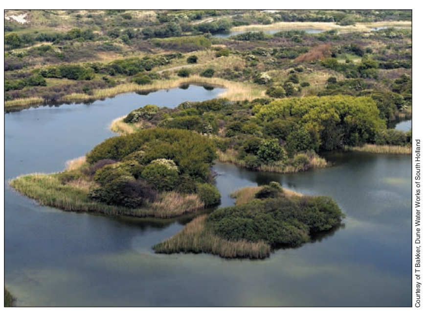
Figure 1. Artificial lakes covering coastal dunes represent ecologically designed systems to provide drinking water for large cities in the Netherlands.

There is a pressing need for further collaborations between ecologists and corporations, governmental agencies, and advocacy groups, at local and international levels. Business practices have substantial impacts on the environment, but if informed by ecological knowledge,