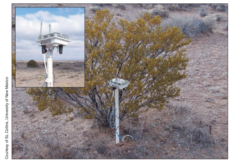
Figure 3. Ecologists are beginning to take advantage of emerging technologies for the remote collection of environmental information. Here one of a network of Sensor Web pods, developed at NASA/JPL, is shown monitoring the microclimate beneath a creosote bush at the Sevilleta Long Term Ecological Research site. Each Sensor Web pod contains six environmental sensors (light, air temperature, humidity, soil temperature and soil moisture at two depths) and wirelessly communicates sensor data to other pods in its local neighborhood, thus distributing information throughout the instrument as a whole. Information is then relayed via a "mother pod" to a laptop and then posted directly on the Internet (http://sev.lternet.edu/research/SWEETS/index.html).

Ecological Analysis and Synthesis (NCEAS); and (4) improve integration of ecological knowledge into policy and management through the creation of an international network of centers for the ecological implementation of solutions. Ideally, the four components of this initiative would be international in research scope and participation. Such a combination of programs and centers would provide opportunities and services to users pursuing investigator-initiated, question-driven studies and applications (Figure 4).