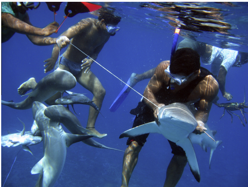
Fig. 2. Reef sharks have been severely depleted across their range, but still remain abundant in certain remote ecosystems. The residents of Tabuaeran Atoll harvest reef sharks for their meat, fins, skin, and teeth. Shark fins are one of the few sources of cash income for the members of this remote atoll.

Remote places are also, almost by definition, sub-optimally situated for the application of ecosystem services conservation. The low population densities and isolation that characterizes remote areas means that there are fewer endemic service recipients in these zones and that it may be harder to trace service provision from remote ecosystems to populated centers. Palmyra provides a good example. Researchers are currently investigating whether Palmyra, as a less-disturbed marine ecosystem, may help replenish reef biodiversity at other populated atolls in this region via larval