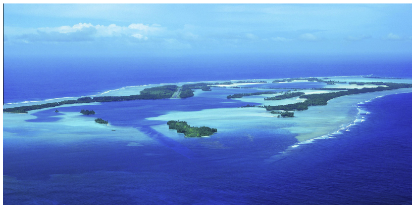
Fig. 1. Palmyra Atoll is one of the most remote sites in the United States and serves as an excellent example of how less-disturbed reef ecosystems function. Palmyra was directly purchased to conserve the biodiversity that it harbors.

The two model remote sites that we will use to illustrate our points in this discussion are Palmyra (5°52'N, 162°04'W; USA)