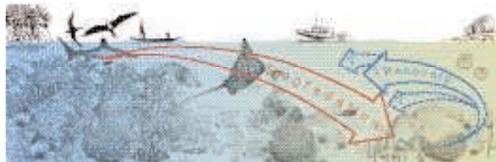
The slippery slope of coral reef decline through time.

C oral reefs provide ecosystem goods and services worth more than $375 billion to the global economy each year (1). Yet, worldwide, reefs are in decline (1–4). Examination of the history of degradation reveals three ways to challenge the current state of affairs (5, 6). First, scientists should stop arguing about the relative importance of different causes of coral reef decline: overfishing, pollution, disease, and climate change. Instead, we must simultaneously reduce all threats to have any hope of reversing the decline. Second, the scale of coral reef management—with mechanisms such as protected areas—