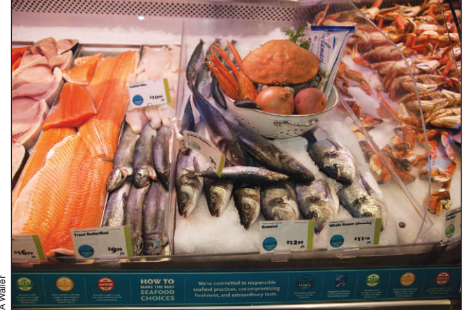
Figure 1. Certification labels and recommendation lists signal ecologically sustainable seafood products to consumers.

and their effectiveness has been debated (Jacquet and Pauly 2007; Ward 2008; Jacquet et al. 2010; Froese and Proelss 2012; Martin et al. 2012), in part because existing certification programs do not comprehensively examine whole marine ecosystems and the human societies that depend on them. Fisheries or aquaculture operations can be certified despite degradation of marine ecosystems, loss of income among local people, and negative social impacts from the non-certified fisheries and aquaculture operations that overlap certified production systems. Furthermore, the high financial costs and data requirements associated with meeting certification and recommendation-listing standards often discourage or prevent small-scale seafood harvesters and producers from participating (Ward and Phillips 2008). For instance, while a substantial fraction of global fisheries catch and most fisheries jobs are generated in developing countries, developing-world fisheries account for only 8% of the total MSC-certified fisheries. Even in the developed world, smaller vessels are often unable to afford the high cost of certification assessment (Reed et al. 2013). For these seafood producers, alternative approaches are needed to incentivize sustainable practices.