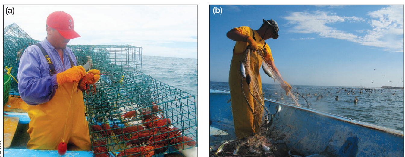
Figure 3. (a) Lobster and (b) finfish fishing in the Vizcaino region of Baja California, Mexico.

and Exploitation Areas of Chile, and the coastal shellfish of Uruguay (Castilla and Defeo 2001; Castilla and Gelcich 2008; Gelcich et al. 2010). Where institutions are not sufficiently comprehensive and organized, lack jurisdiction over resources and ecosystems, or possess jurisdiction that is too localized or limited to specific resources, actions first must be directed toward building such capacity and tenure (eg Basurto 2005, 2008). Access privileges that extend to entire ecosystems are required to create stewardship incentives that extend to all the fisheries and aquaculture activities in a given area (Fujita et al. 2013). In some cases, it might be possible to form ad-hoc institutions (eg cooperatives or coalitions among governmental agencies, resource users, and other interested parties). Formalization and legal recognition of such institutions is important for durability of the program and effective stewardship.