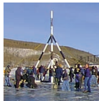
Fig. 1. Townspeople of Nenana, Alaska, raise the tripod on the frozen Tenana River, 4 March 2001.

nana and Fairbanks, Alaska (90 km away). Climatic data for January to April (the months preceding ice breakup) of each year obtained from the Western Regional Climate Center (5) included daily precipitation (PCPN), snowfall (SNFL), and air temperature minima (TMIN) and maxima (TMAX). Years in which any month had fewer than 15 days of data were removed from analysis, leaving 32 to 35 years of data for the Nenana records and 47 to 51 years for the Fairbanks records. Heat-island effects due to urbanization and movement of the weather station may affect the Fairbanks record. By con-