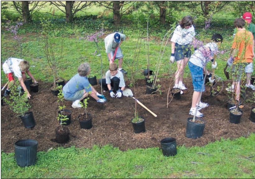
Figure 2. Students and community leaders help plant seedlings to vegetate a rain garden in Kensington, Maryland. Rain gardens such as these are designed to increase infiltration of rainwater into the soil and minimize run-off of nutrient or pollutant-rich water into stormwater systems that feed streams and rivers.

these practices can help sustain ecosystem services, for example through appropriate waste-disposal practices or the use of less environmentally persistent chemicals (Loucks et al. 1999). A recent report by the Council for Environmentally Responsible Economies (CERES), a coalition of environmental, investor, and advocacy groups, examined how 20 of the world's biggest emitters of greenhouse gases are factoring climate change risks and opportunities into their business practices (Cogan 2003). The report features a checklist of specific actions that companies can take to address climate change. Ecologists can play an active role in such projects through direct involvement or through research motivated by the needs of such ventures.