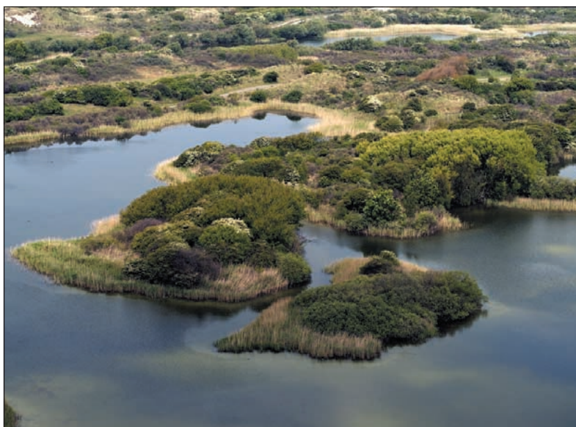
Figure 1. Artificial lakes covering coastal dunes represent ecologically designed systems to provide drinking water for large cities in the Netherlands.

There is a pressing need for further collaborations between ecologists and corporations, governmental agencies, and advocacy groups, at local and international levels. Business practices have substantial impacts on the environment, but if informed by ecological knowledge,