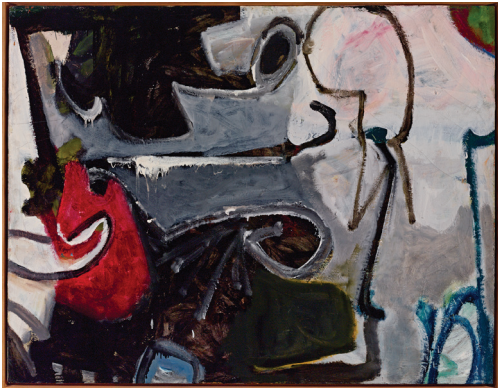
Elmer Bischoff (American, 1916–1991), Untitled (Scene with "X") , c. 1950. Oil on canvas. Gift of Adelle Bischoff, 2006.115

These images are provided for the working media to use in publicizing the exhibition. All other uses are prohibited. The images may not be cropped, bled off the page, overprinted with text, or altered in any way.