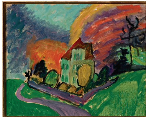
Gabriele Münter (German, 1877–1962), Red Cloud , 1910. Oil on board. Private collection