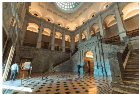
Lobby of the Cantor Arts Center.