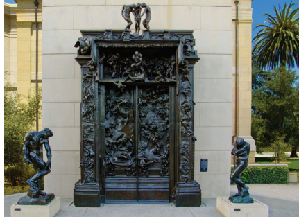
Auguste Rodin (French, 1840–1917), The Gates of Hell (La Porte de l'Enfer) , 1880–c.1900, cast 1981. Bronze. Gift of the B. Gerald Cantor Collection, 1985.86