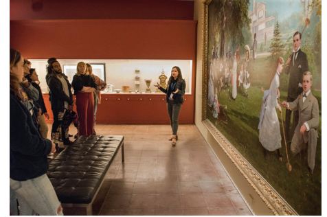
Tour of the exhibition The Melancholy Museum: Love, Death and Mourning at Stanford with the painting Palo Alto Spring in the background