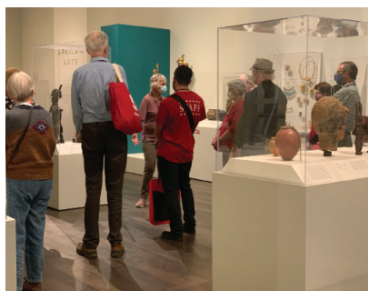
A docent gives a tour in the Thomas K. Seligman Gallery