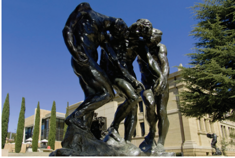
Auguste Rodin (France, 1840–1917), The Three Large Shades (Les Grandes Ombres) , 1902–1904, cast 1979–1980. Bronze. Gift of the B. Gerald Cantor Collection, 1992.158

These images are provided for the working media to use in publicizing the event. All other uses are prohibited. The images may not be cropped, bled off the page, overprinted with text, or altered in any way.