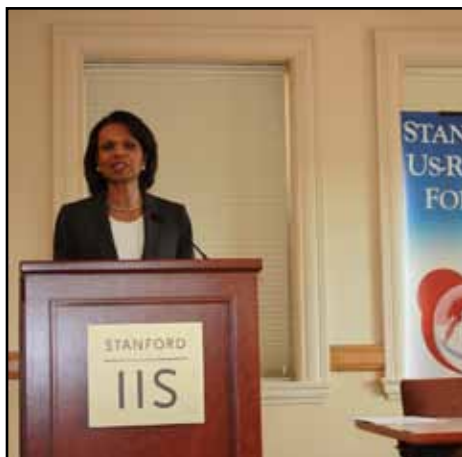
Stanford Professor, Hoover Fellow and former U.S. Secretary of State and National Security Advisor Condoleezza Rice

therefore, encompasses the varied realms – political, social, and cultural – that define US-Russian relations as seen by students from both countries. It represents and reflects the views of the young adult generation and their hopes for a brighter future for both the US and Russia. The underlying theme of these projects has