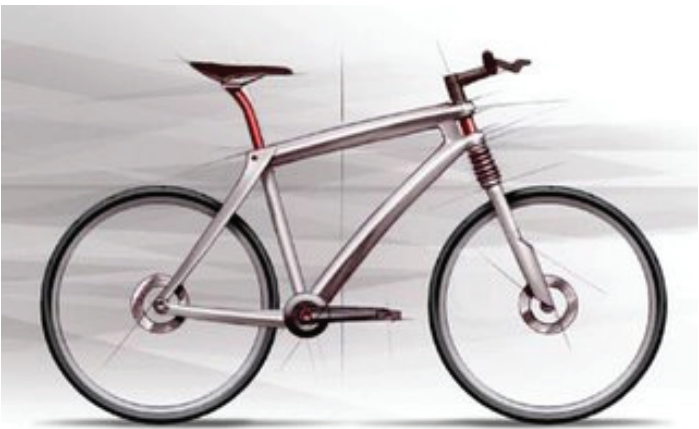
Commuters use bikes for short 1-2 mile distances.