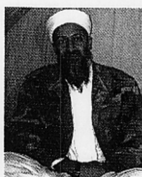
Megalomaniacal Hyperterrorists: Yousef, McVeigh, Asahara, and bin Laden

scholarly models, and intelligence profiles. They are political, conservative in their use of weapons, and low-casualty perpetrators. Though angry, lethal, and ready to take great personal risks, they are largely rational and realistic. They act in groups or organizations, use the media to get attention, and wish to transform their fights into legitimate military campaigns and political power. They kill, maim, hijack, abduct, bomb, and even blow themselves up in suicide missions, but their leaders, ideologues, gurus, and clerics prefer to avoid catastrophes in order to secure sympathy in the post-terrorism stage. As terrorism expert Brian Jenkins famously remarked, such leaders wish to have "lots of people watching, not lots of people dead."