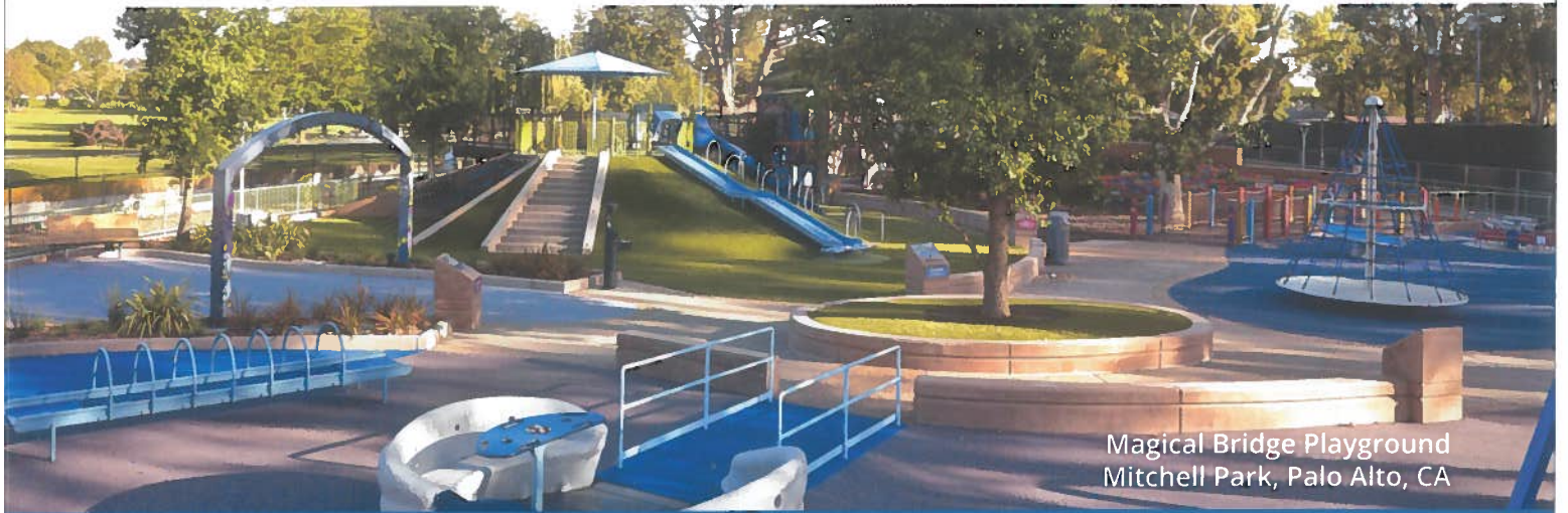
Magical Bridge Playground Mitchell Park, Palo Alto, CA