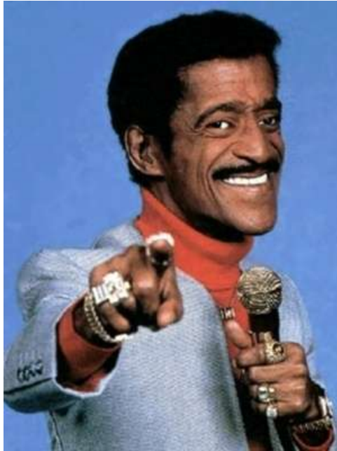
Sammy Davis Jr. Performer Lost Eye