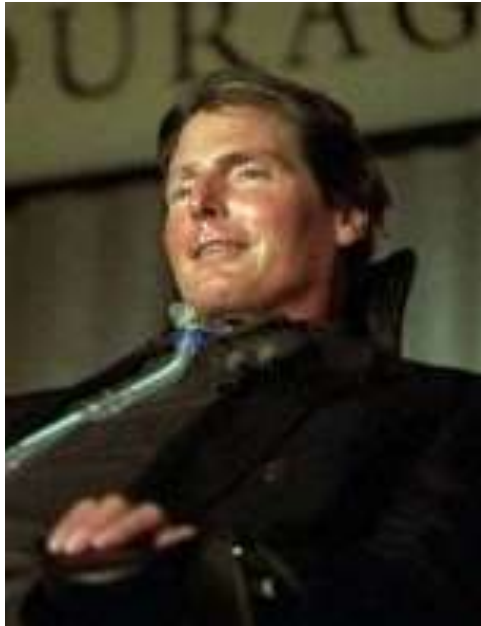
Christopher Reeve Actor Spinal Cord Injury