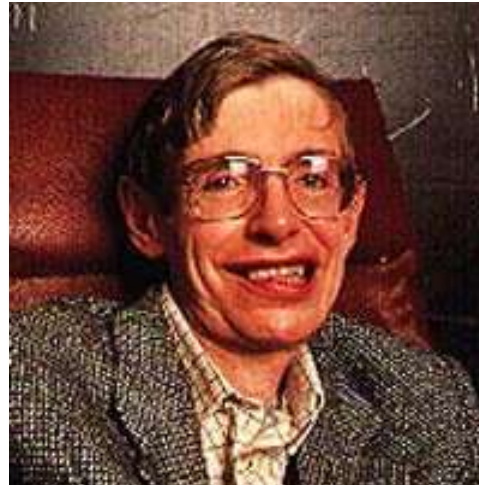
Stephen Hawking Physicist ALS