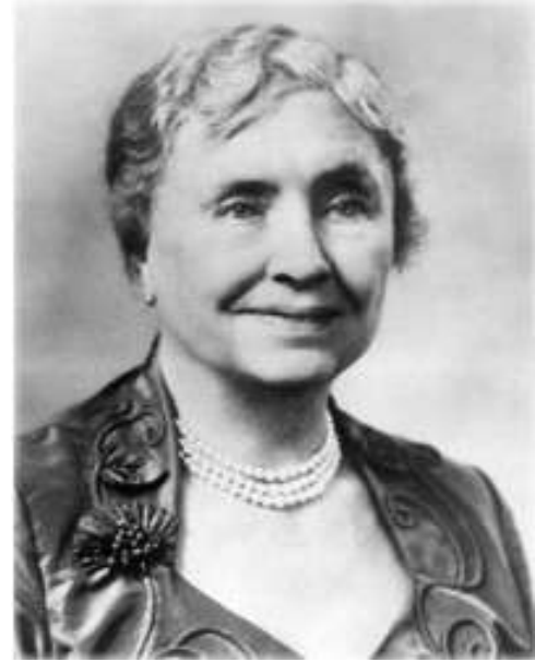
Helen Keller Author Deaf-Blindness

Others became disabled after they achieved notoriety.