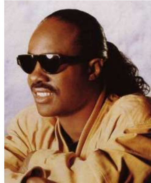
Stevie Wonder Singer / Songwriter Blindness

Acceptance in society is another important concern.