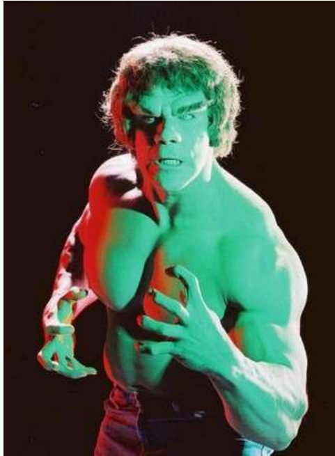
Lou Ferrigno Actor Hearing Impairment