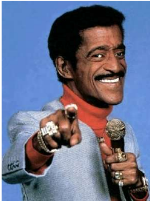
Sammy Davis Jr. Performer Lost Eye