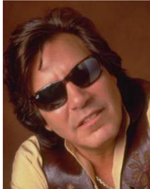
Jose Feliciano Musician Blindness