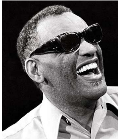
Ray Charles Musician / Singer Blindness