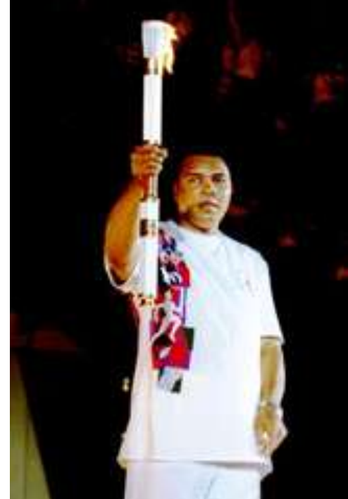
Mohammad Ali Boxer Parkinson's Disease

Ability and talent comes from education and opportunity.