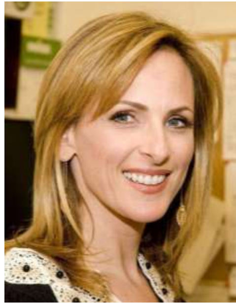
Marlee Matlin Actress Hearing Impairment