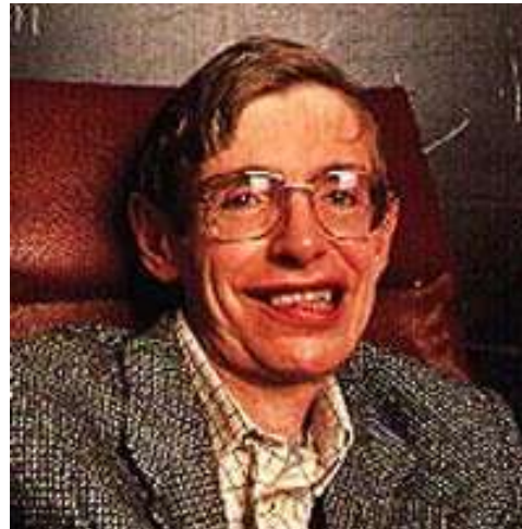
Stephen Hawking Physicist ALS