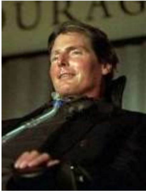
Christopher Reeve Actor Spinal Cord Injury