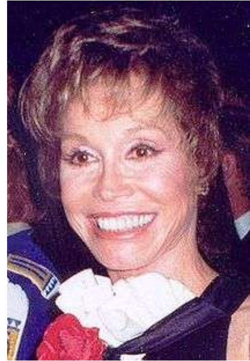
Mary Tyler Moore Actress Diabetes

Talent and the ability to contribute trumps disability.