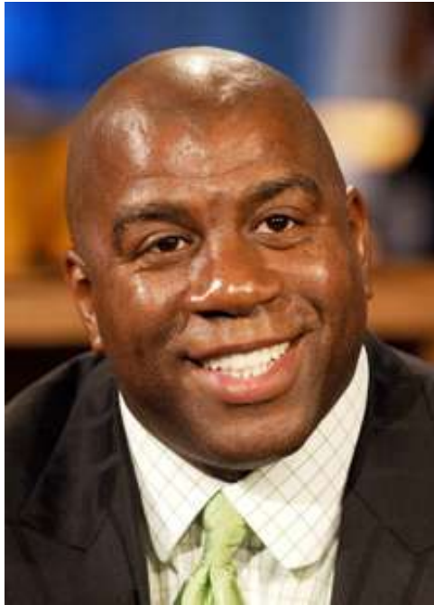
Magic Johnson Basketball Player HIV