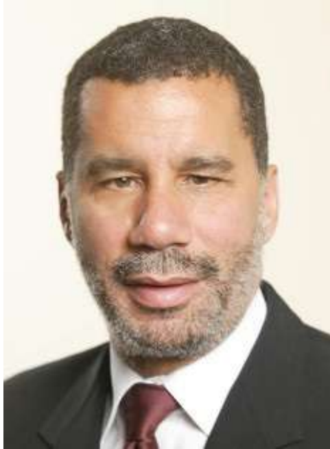
David Patterson Governor of NY Blindness