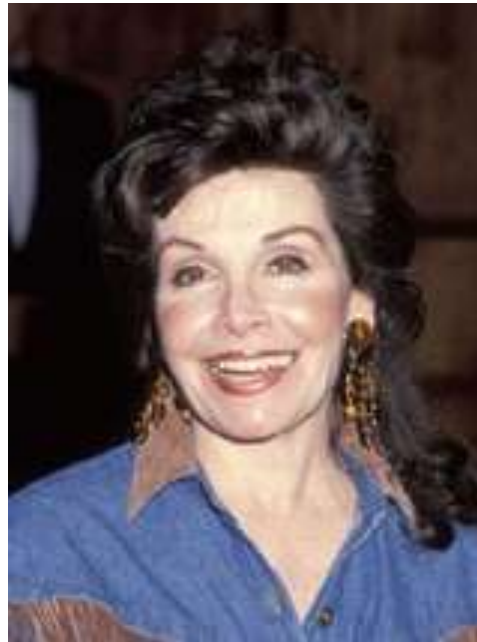
Annette Funicello Mouseketeer Multiple Sclerosis