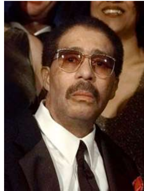
Richard Pryor Comedian Multiple Sclerosis