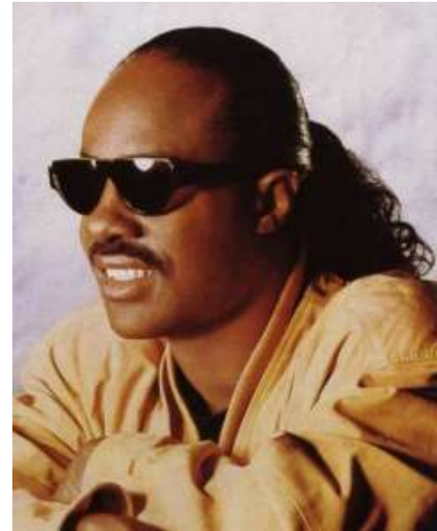
Stevie Wonder Singer / Songwriter Blindness

Acceptance in society is another important concern.