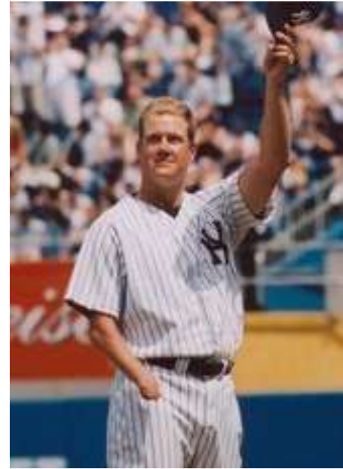
Jim Abbott Pitcher Congenital Deformity

They pervade all aspects of our society.