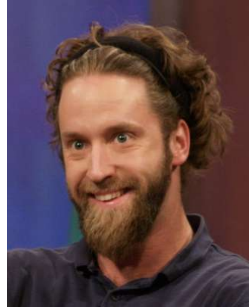
Josh Blue Comedian Cerebral Palsy