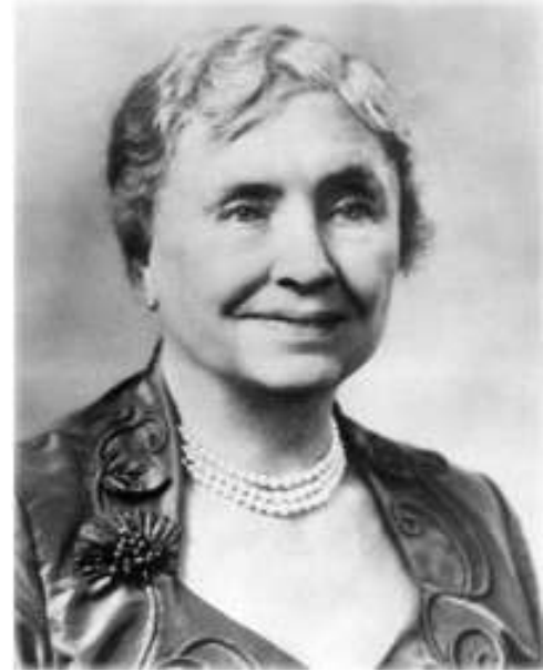
Helen Keller Author Deaf-Blindness

Others became disabled after they achieved notoriety.