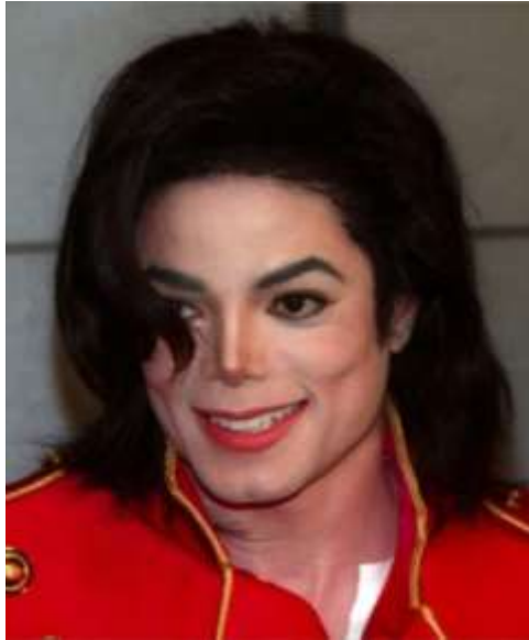
Michael Jackson Performer Vitiligo