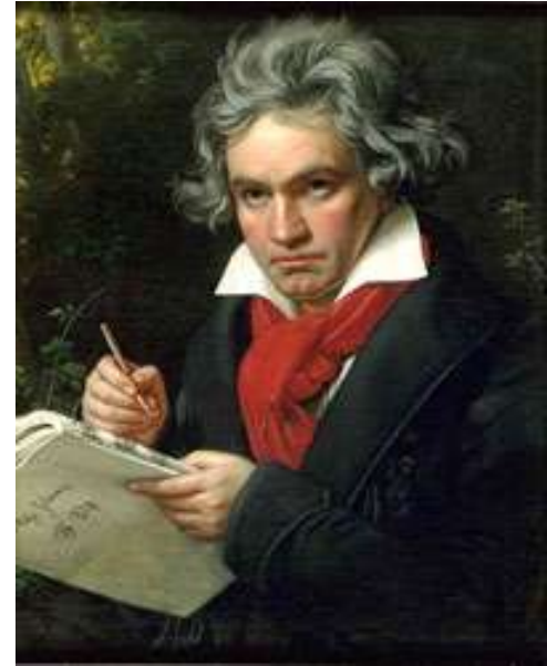
Ludwig Von Beethoven Composer Hearing Loss

They contribute with their underlying talent and abilities.