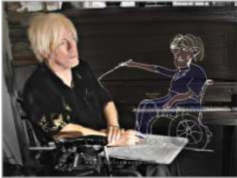
John Callahan Cartoonist Spinal Cord Injury