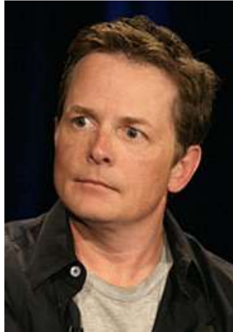
Michael J. Fox Actor Parkinson's Disease