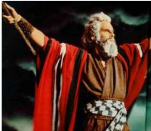
Moses Religious Leader Speech Impediment