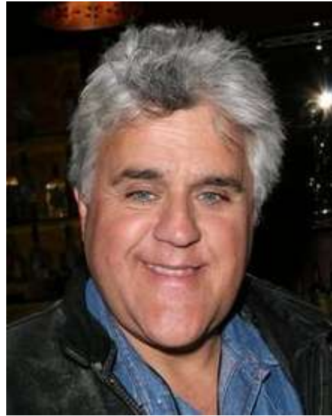
Jay Leno Comedian Dyslexia