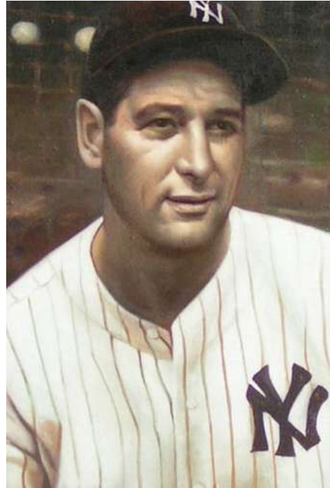
Lou Gehrig Baseball Player ALS