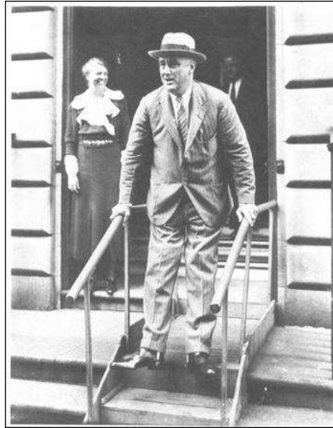
Franklin D. Roosevelt President Polio