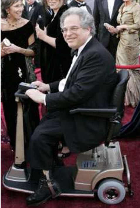
Itzhak Perlman Violinist Polio