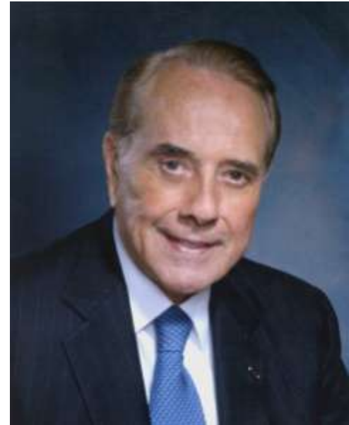
Bob Dole Senator Paralysis

Some are / were disabled from birth or from an early age.