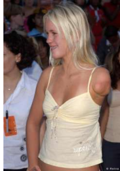
Bethany Hamilton Surfer Lost Arm

Assistive technology levels the field so that an individual's talent and skills can flourish.