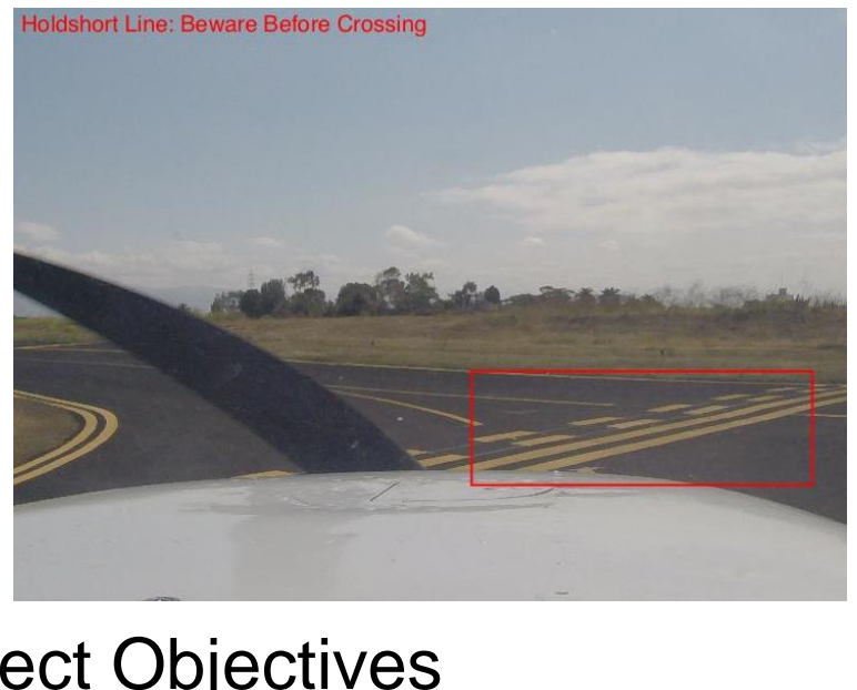
Figure 1 Runway Incursion Scenario and Project Objectives