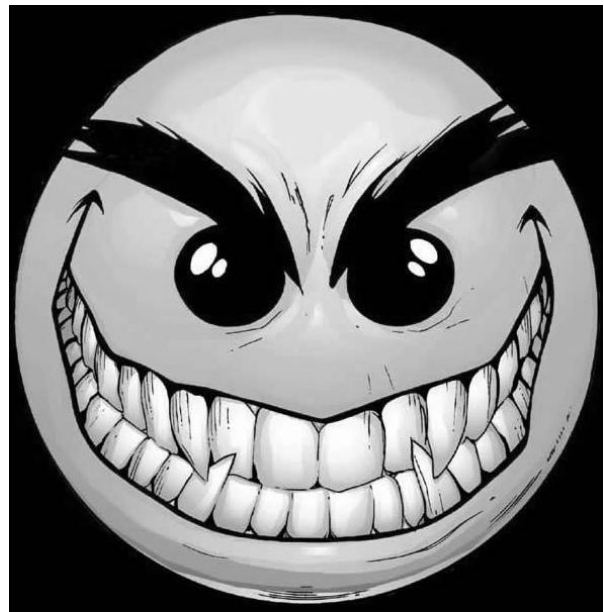
TSP Dot Photomosaic