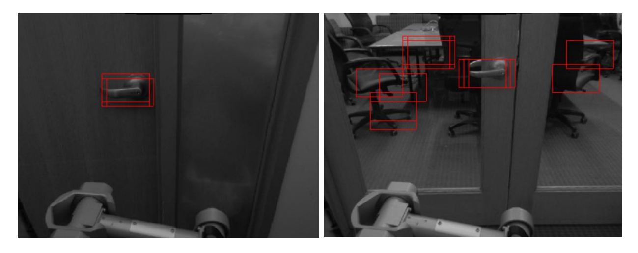
Figure 2 – Sliding Window results for (a) opaque and (b) glass doors

We define the localization error of a handle as the pixel-wise difference between the ground truth (i.e. user selected) center of the handle (on 2D image) and the center predicted by the sliding window search. The average localization error is obtained as 4.84 pixels for the opaque doors in the test set. For the transparent doors the localization error is obtained as 67.12 pixels. Hence we can conclude that for opaque doors the handle can be accurately localized; however we cannot obtain the true position of the handle if the door is transparent. Although the sequential evaluation of the 2D-3D classifiers reduces the number of false positives significantly, accurate localization necessitates a complete elimination of the false positives. For better accuracy a separate classifier for the transparent doors might be trained.