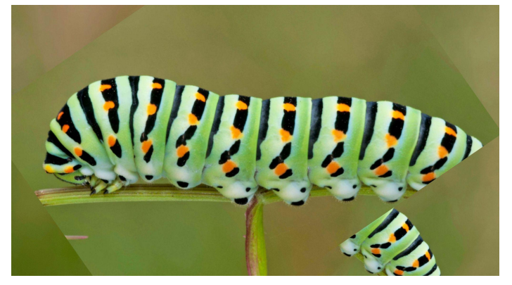
Figure 3. Caterpillar base image