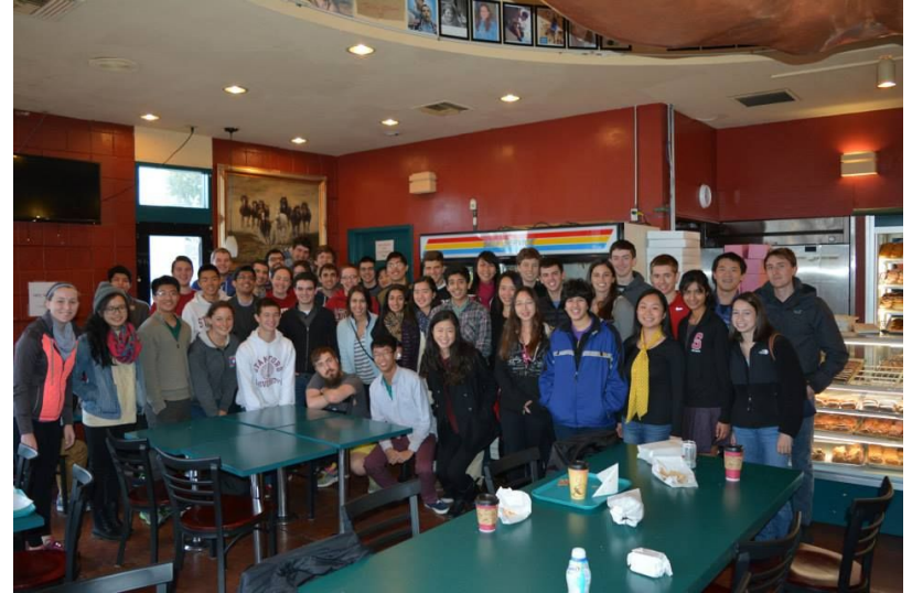
Welcome breakfast for new SLs