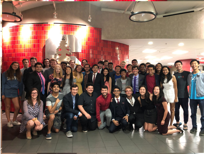
SLs keeping it classy for LaIR Formal