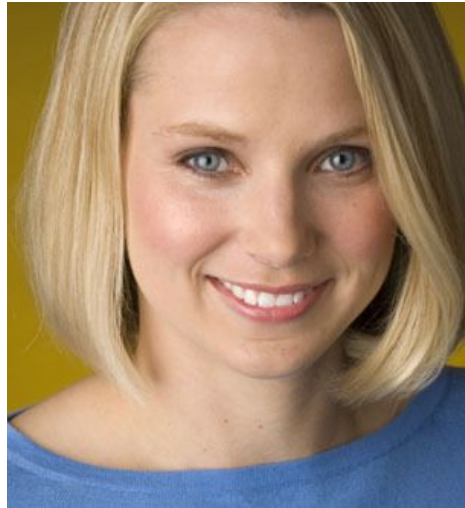
Marissa Mayer Former CEO Yahoo